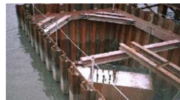
ADEKA ULTRASEAL A-30

(800) 999-3959 or visit http://www.adeka.com